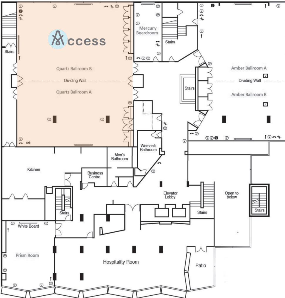
Matrix Hotel 2nd Floor